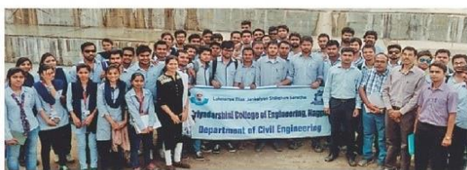
CE students of PCE during a field visit at Kochi Dam recently.